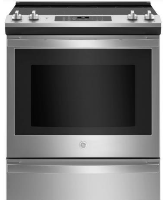
GE JS760SPSS Slide-In Electric Range