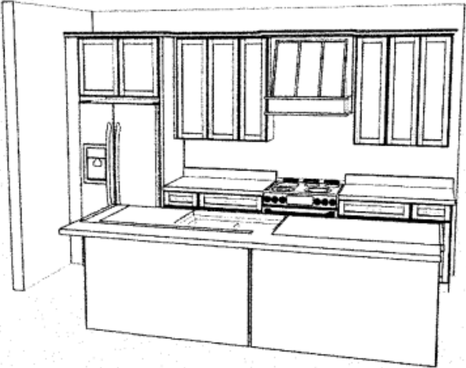
Back Side of Island