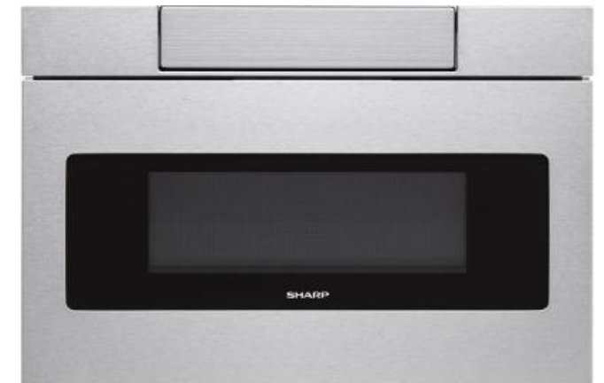
Sharp SMD2470ASY Microwave Drawer in Island *Cost of $845.80 in Addition to "Upgraded Appliance Package"*