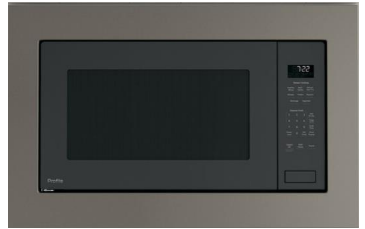
GE PEB7227ANDD Built-In Microwave w/ Trim Kit in Island *Included in "Upgraded Appliance Package" Price*