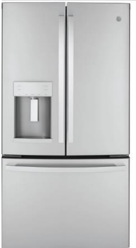
GE GYE22GYNFS Counter-Depth Refrigerator