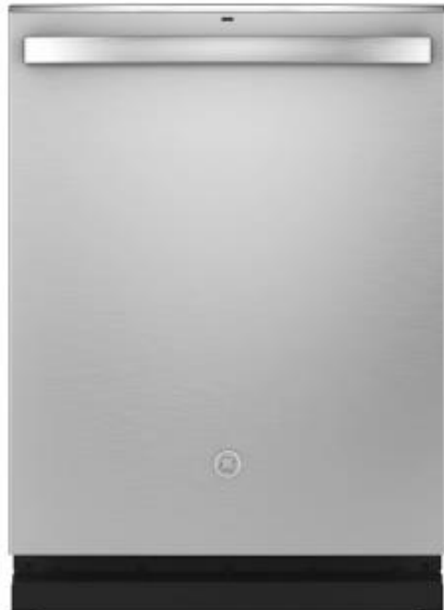
GE GDT670SYVFS Dishwasher